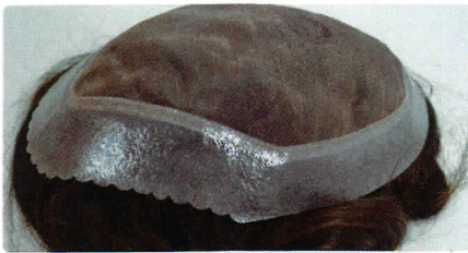
M100 Most popular

6.5"x8.5" Down to 5.5"x8" Fine silky mono lace top with 1" clear PU perimeter for taping