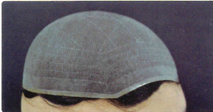
M110 Light density+Super natural

8"x10" Down to 7"x9" Mono lace top + 1" clear skin taping perimeter, 1/2" French lace front