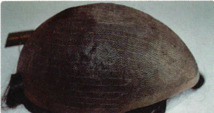
M103 Cool,Durable lace

7.5"x10" Can cut to 7"x7" or 7.5"x8.5" Mono lace top with poly coated eage