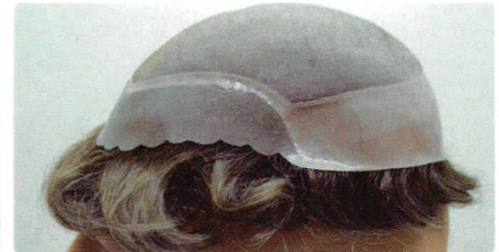
M108 Large+Easy attach

7.5"x9.5" Down to 6.5"x9" Fine welded mono lace with 1" PU coating temple to temple and sewed on taping tab front