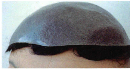
M101 Soft Skin base

6.5"x8.5" Down to 5.5"x8" Fine silky mono lace top with 1" clear PU perimeter for taping