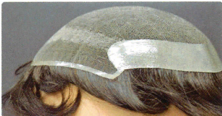
M106 Most Natural hairline

6.5"x8.5" Down to 5.5"x8" French lace with 1" clear PU coating from temple to temple across back