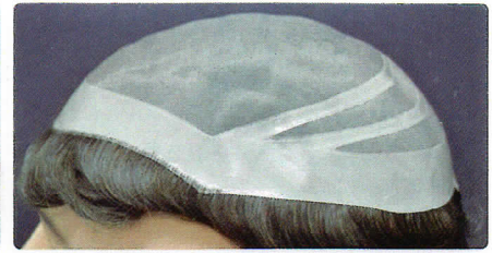
M102 Fit different size

8"x10" Any size Soft clear polyurethane skin base